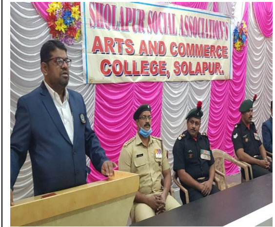
Principal guiding the NCC Cadets