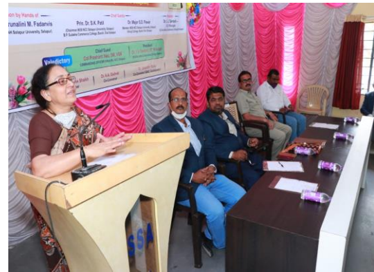
Vice Chancellor guiding his students