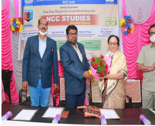
Principal greating the flower of the Vice-Chancellor