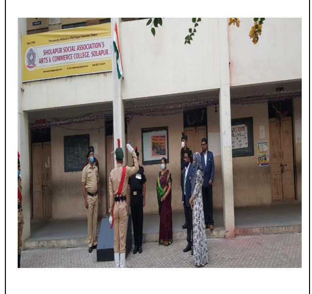
Saluting at the time of Flag Hosting