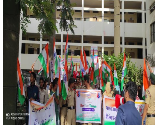
Har Ghar Tiranga Rally