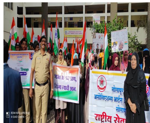
Har Ghar Tiranga Rally with Students