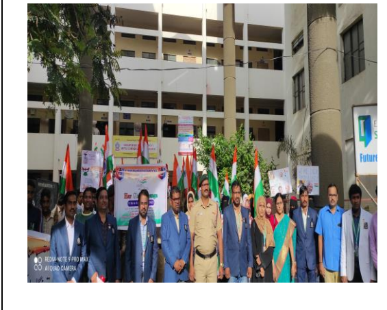
Inaugurating Rally by Principal