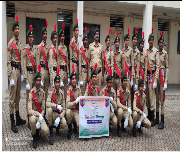
Group Photo with NCC Boys Units