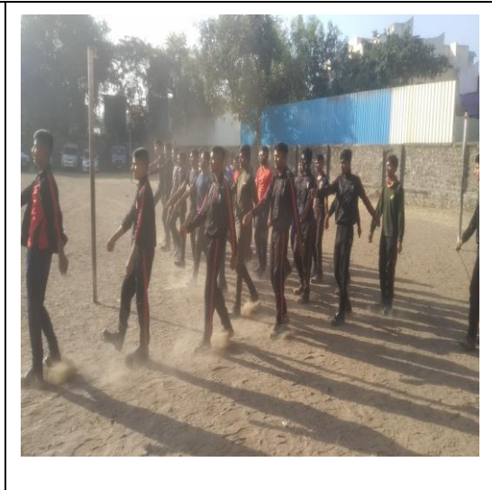
Doing NCC Parade Drill Practice by NCC Cadets