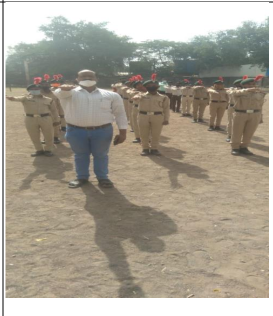
Voters day Oath taking