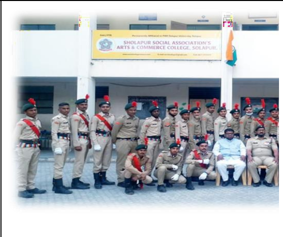
Independence day celebrated NCC Cadets