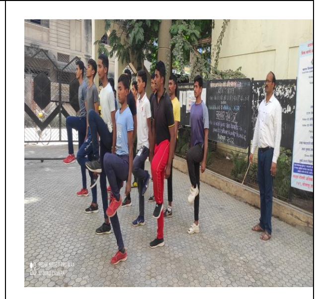
NCC Cadets doing Parade drill