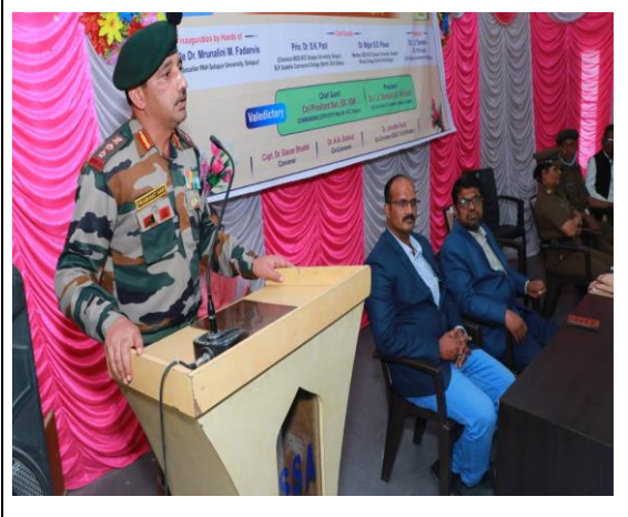
Commanding Officer guiding NCC Cadets