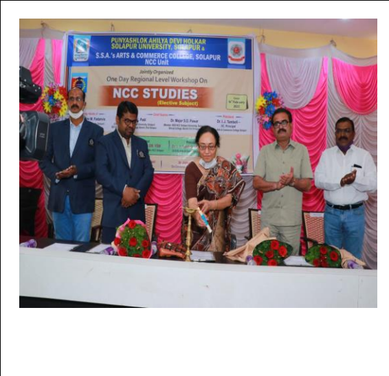
Vice-Chancellor inaugurating the program by lighting the candle