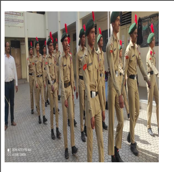
NCC Cadets doing Parade drill