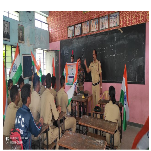
Lecture attended by NCC Cadets