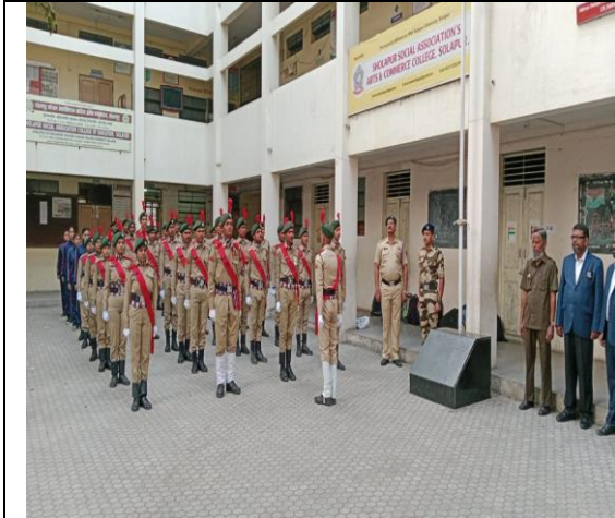
Doing NCC Cadets Republic Day Parad