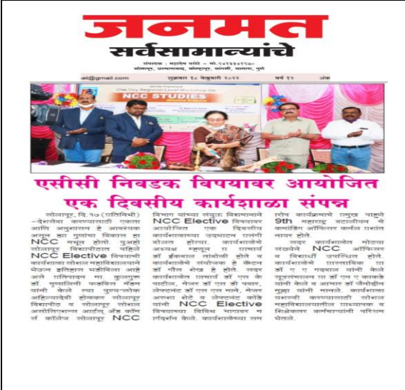
News of the program in the newspaper