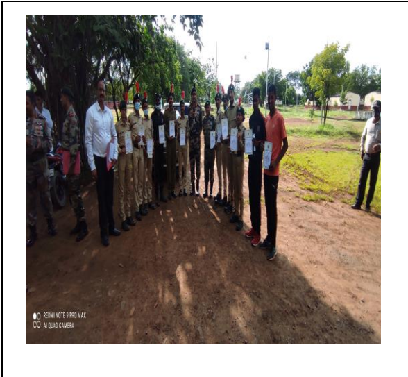
NCC Cadets Receiving Camp Certificate