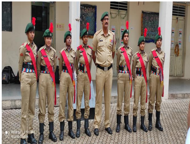
Group Photo with NCC Girls Unit